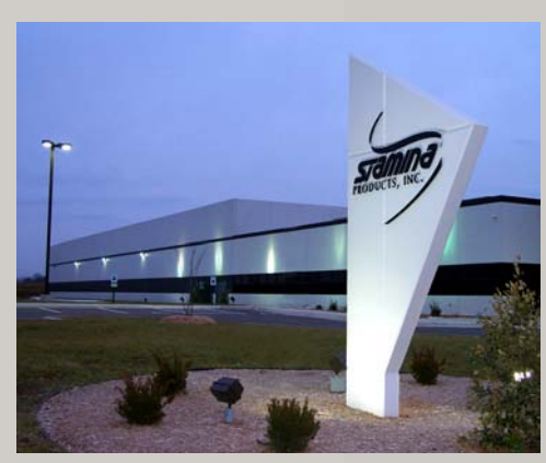
Utilizing the original Enterprise Zone, Stamina Products became the first company to locate in the 400-acre, Partnership Industrial Center West.

For specific questions about aspects of the Springfield Enhanced Enterprise Zones please use the contacts listed below.