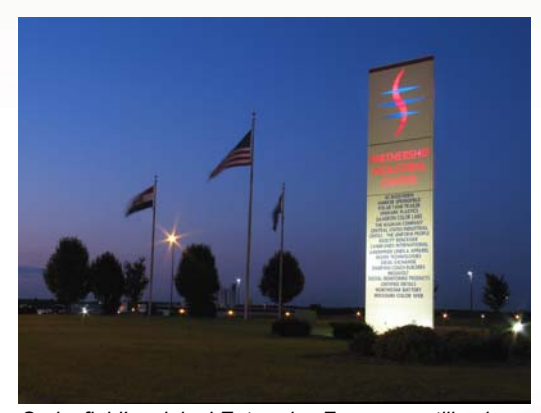
Springfield's original Enterprise Zone was utilized heavily in the development of Partnership Industrial Center, which is now home to over 20 manufacturing operations.

The Springfield Enhanced Enterprise Zones encompasses a large amount of available commercial and industrial property. The zones have an abundance of prime industrial sites