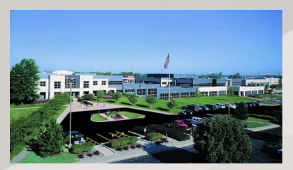
The original Enterprise Zone assisted companies such as Prime in expanding their presence in Springfield.

To receive tax credits in any of the five years, the facility must create at least 2 new jobs and $100,000 in new investment compared to the base year (the year prior to the commencement of operations at the facility). Eligible investment expenditures include the original cost of machinery, equipment, furniture, fixtures, land and building, or eight times the annual rental rate paid for the same. Inventory is not eligible.