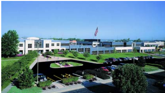
The original Enterprise Zone assisted companies such as Prime in expanding their presence in Springfield.

operations at the facility). Eligible investment expenditures include the original cost of machinery, equipment, furniture, fixtures, land and building, or eight times the annual rental rate paid for the same. Inventory is not eligible.