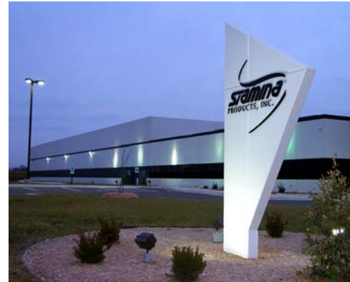
Utilizing the original Enterprise Zone, Stamina Products became the first company to locate in the 400-acre, Partnership Industrial Center West.

For specific questions about aspects of the Springfield Enhanced Enterprise Zone please use the contacts listed below.