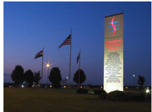
Springfield's original Enterprise Zone was utilized heavily in the development of Partnership Industrial Center, which is now home to over 20 manufacturing operations.

The Springfield Enhanced Enterprise Zone was officially designated by the Missouri Department of Economic Development on July 20, 2005. The Zone encompasses 68 square miles in Springfield and unincorporated Greene County as well as a small segment of the community of Battlefield. The area within the zone has higher than average unemployment and the purpose of the zone is to stimulate business investments and promote the creation of jobs in such areas. Much of the Enhanced Enterprise Zone was previously included in the original Enterprise Zone, designated in 1984. Springfield's Enterprise Zone has been a leader in job creation and new business investment in the State. From 1984 to 2004, the Springfield Enterprise Zone facilitated 485.5 million dollars of investment and resulted in the creation of 6,340 new jobs.